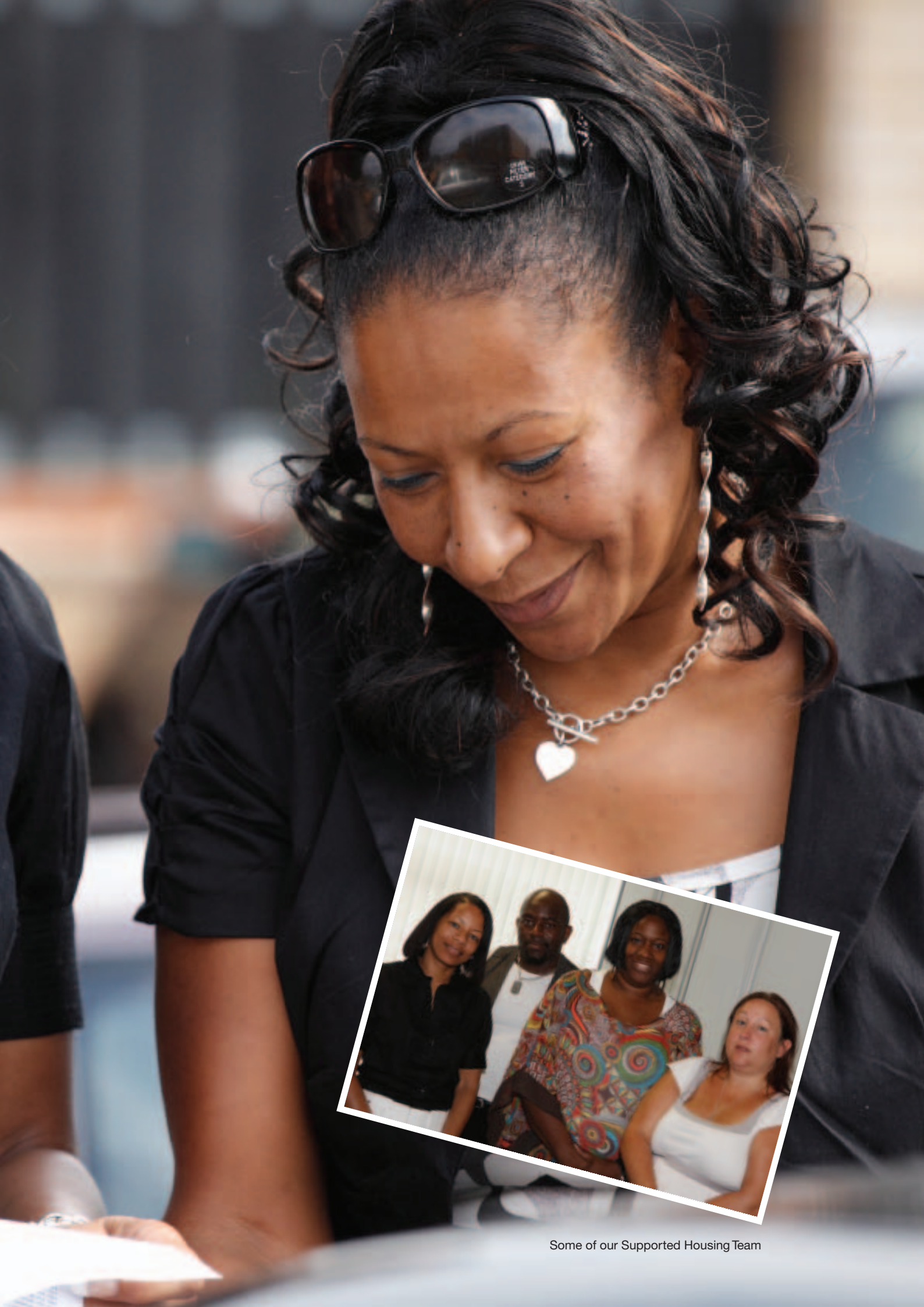
Some of our Supported Housing Team