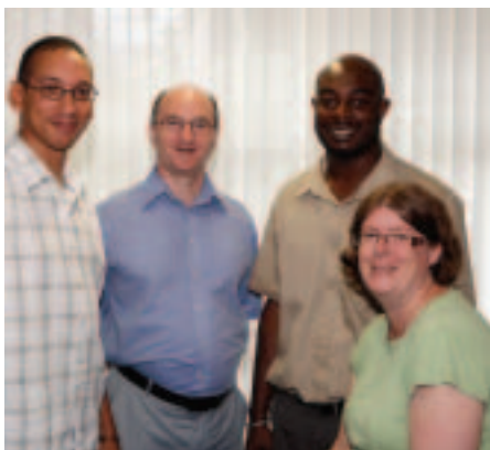
Some members of our Housing Services department

You can find more information about this initiative at www.inbiz.org