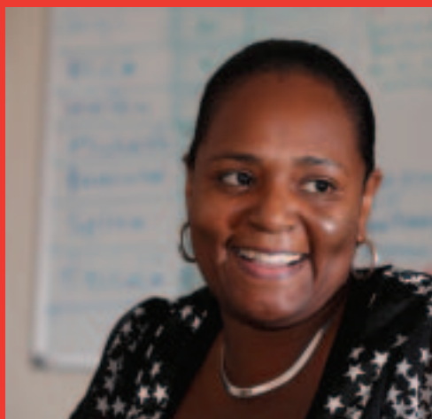
Floating Support staff members