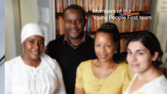
Members of our Young People First team