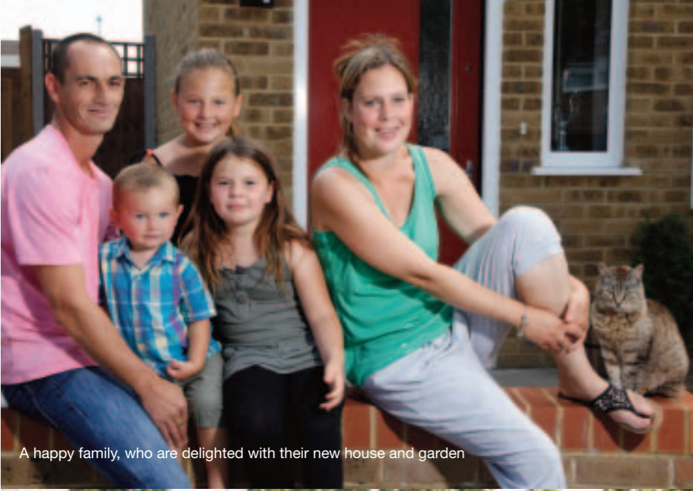
A happy family, who are delighted with their new house and garden