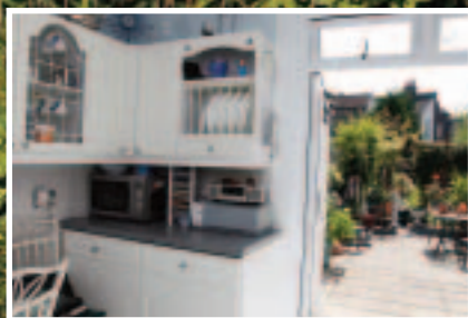
Paula, a long-standing tenant, has created a wonderful home and garden