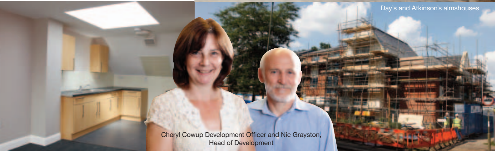
Day's and Atkinson's almshouses