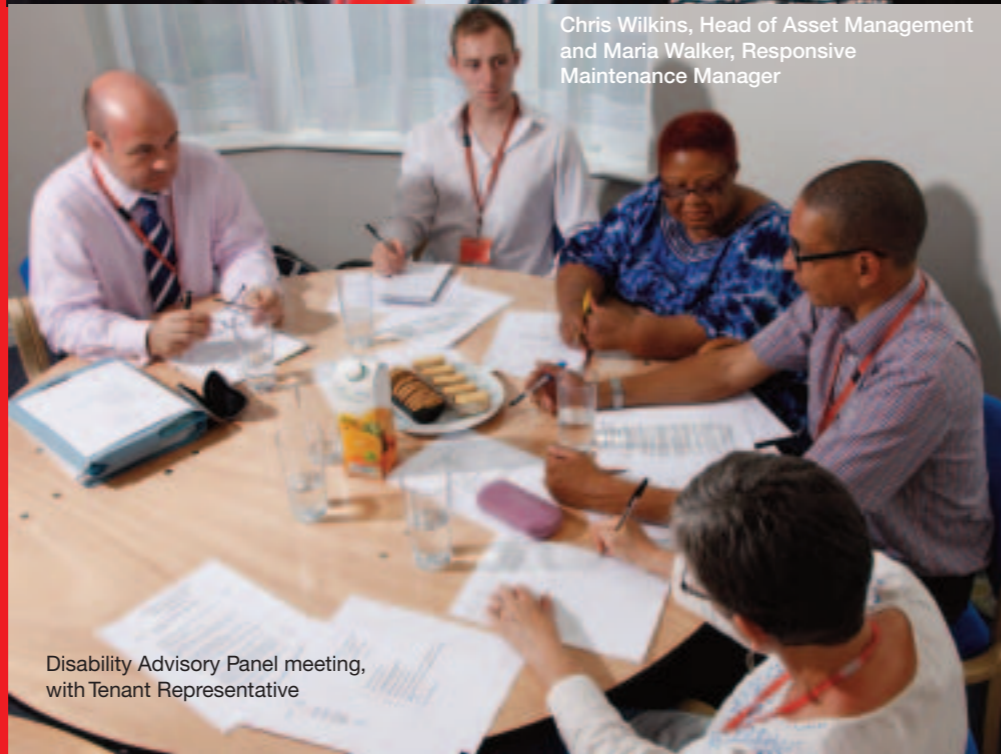
Disability Advisory Panel meeting, with Tenant Representative