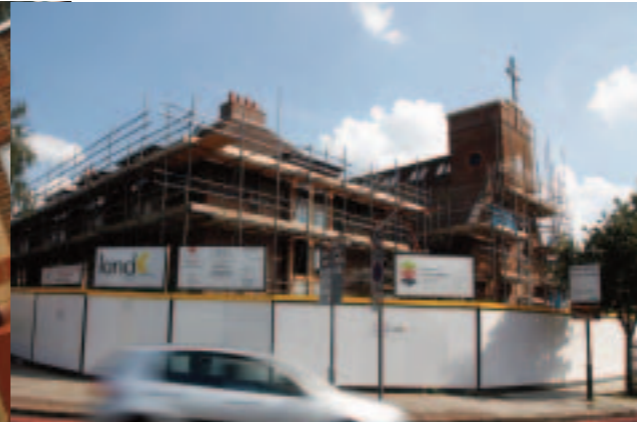
Site Manager of Trinity Church re-development