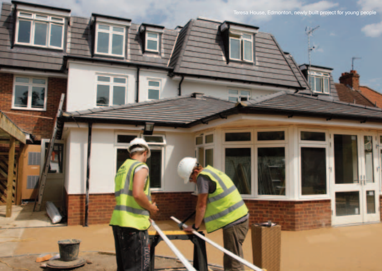
Teresa House, Edmonton, newly built project for young people